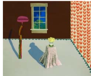
Jennifer Wynne Reeves, Companionship , 2005. Gouache on paper, 11 x 14 inches.