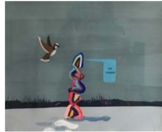
Jennifer Wynne Reeves, It's alright , 2005. Gouache on paper, 11 x 14 inches. Private Collection, New York.