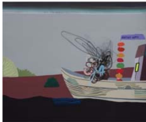
Jennifer Wynne Reeves, Abstract Sailors , 2005. Gouache on paper, 11 x 14 inches. Private Collection.